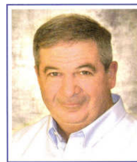
Each Office is Independently Owned And Operated.